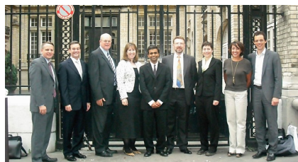
FOSI Board Members in Paris. They came from the US, France, Spain, the UK and Russia.